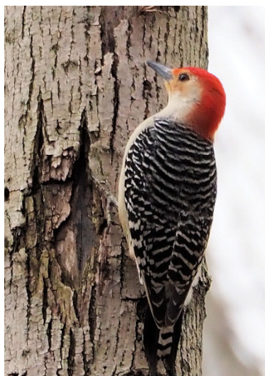
Red Bellied Woodpecker

Just a small sample of the beautiful plants found in the Preserve.