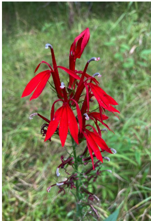
Cardinal Flower ( Lobelia cardinalis )

Just a small sample of the beautiful plants found in the Preserve.