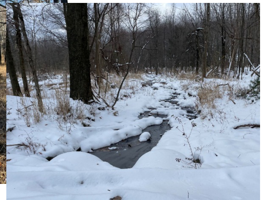
One of the 5 streams in winter

The intention of this issue was to give you a glimpse of the beauty of the preserve, found right in the middle of your neighborhood. Hopefully it instills a desire to help protect this special place. Join us in preserving the Preserve by becoming a member of the Friends of Euclid Creek. Sign up here https://www.friendsofeuclidcreek.com