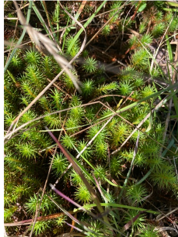
Fairy Cap Moss

Two mosses ( Lycopodium sp) that are generally only found in the wet habitat that the Dusty Goldenrod preserve provides.