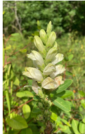
Turtlehead ( Chelone glabra )